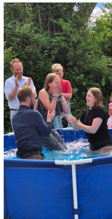
2 — Graveyard Baptism