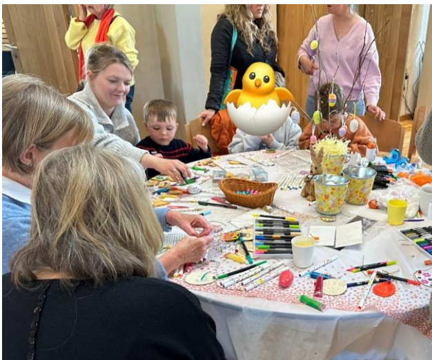
3 — Craft at Easter

Our Crafty Easter and Crafty Advent Saturday mornings have been as popular as ever, as was the Light Party on 2nd November. It was wonderful to see so many at the Christingle service on Christmas Eve. For families who attend regular services, there is Explorer Church in the coffee room providing age-appropriate learning and activities for part of the service.