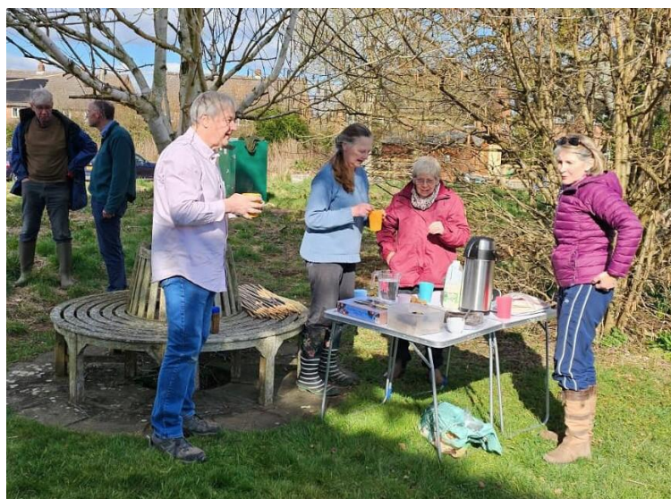
10 — A well-earned tea break

The Churchyard gardeners are currently five in number with two more having expressed an interest in joining the team. We meet on Tuesday Mornings (weather permitting) from 10:00 – 12:30.