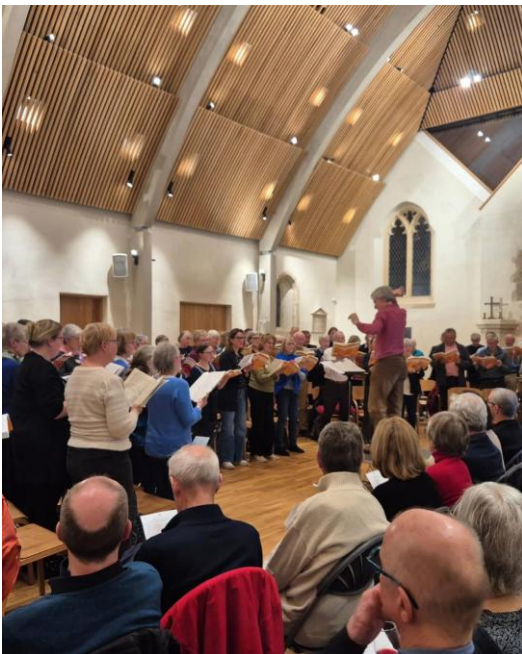
6 — One of our Fantastic Concerts