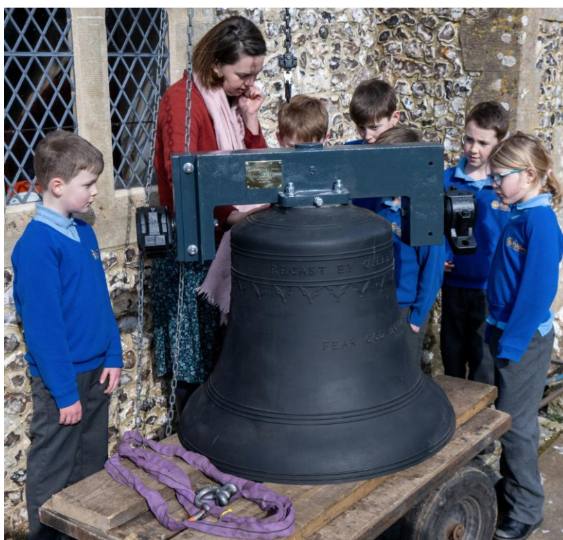
12 — Wow, that bell is bigger than me!

What a year! We have our bells back, well we have five with a loaned bell. With the grant from the National Lottery Heritage Fund we were able to start the re-hanging. The ringers had hoped to have the bells on show in church and have a dedication service, but it did not happen due to a number of reasons. On a Thursday evening the workmen stayed late so we could have a four-bell practice. It started well, then the fourth bell sounded strange. No one was sure what the problem was. It turned out that it was cracked. It is due to be re-cast this year thanks to the generosity of a lot of people. We have a bell on loan in its place.