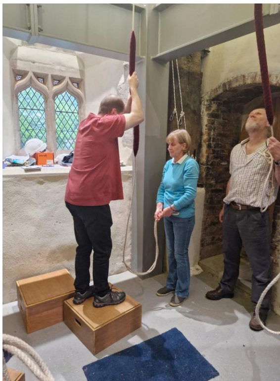
13 — Everybody welcome to have a go!

takes time, one cannot just pull a rope. There are ten regular ringers. We could do with some more willing to learn or even come back to ringing.