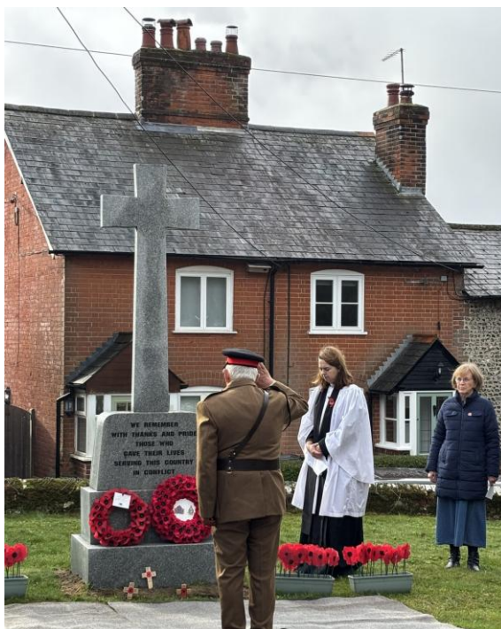
1 — Remembrance Sunday 2025

We are blessed as a church community to be so connected with the wider community in Ropley and beyond. At different points in the year we have gathered to remember - on the village green for the VE Day tribute in May, around the new war memorial outside St Peter's on Remembrance Sunday and in thanksgiving services across the year for those who have died. At other times, it is for enjoyment and fun - the joy of the Pram Race, a wonderful Leavers service for the Year 6s heading off to secondary school and the merriment of the Ropley King Singers' concerts.