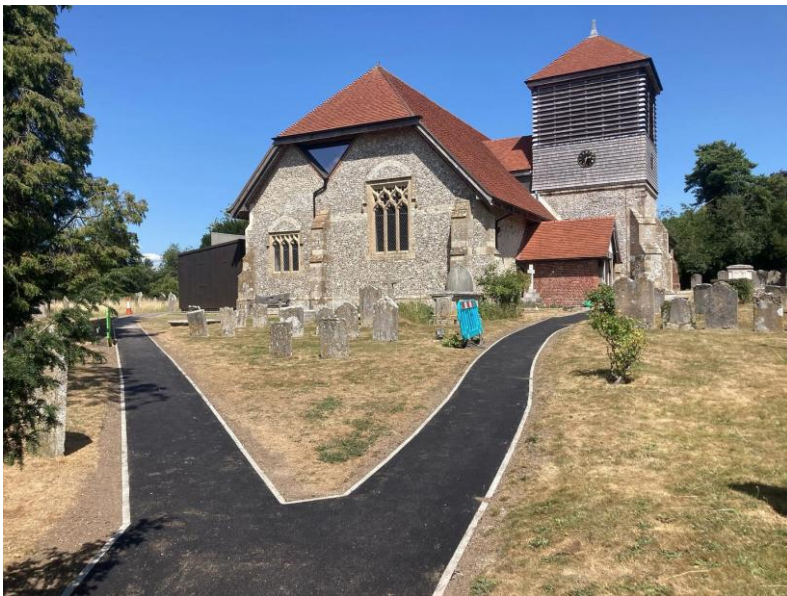
9 — Our Newly Resurfaced Paths

there is a hired one in its place, so the full peal of six bells is there.