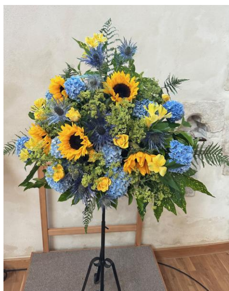
11 — a spectacular arrangement

The St Peter's Flower Ladies have had a busy year! We are a group of eight and have arranged flowers in St. Peter's every week with the exception of Advent and Lent. At Easter, Harvest and Christmas we enjoy all joining together to make the Church look magnificent, usually decorating both porches and the windowsills!