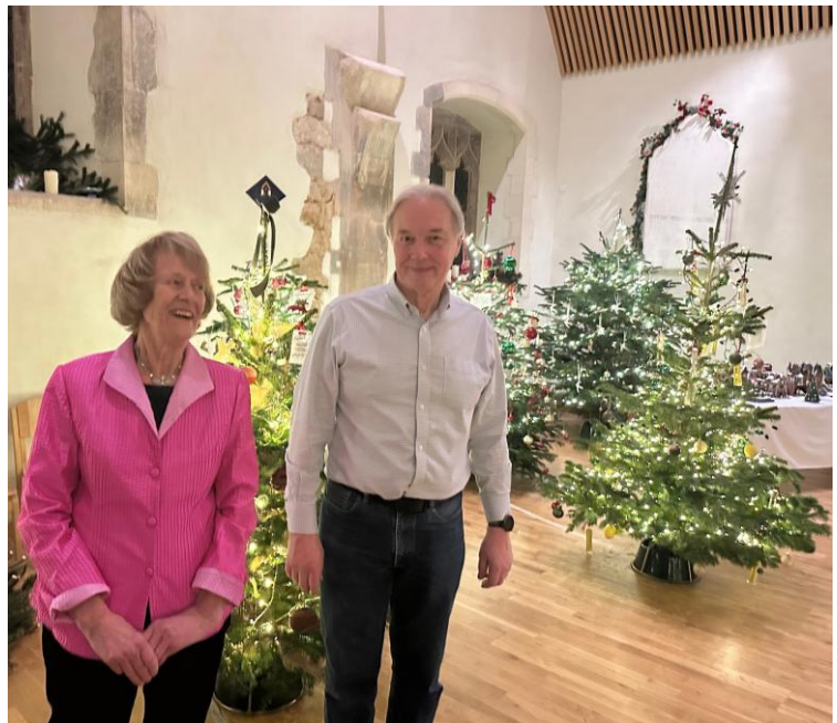
7 — The Christmas Tree Festival

Events & Lettings continue to be a major source of income for St Peter's. In 2025 we raised over £16K from Events.